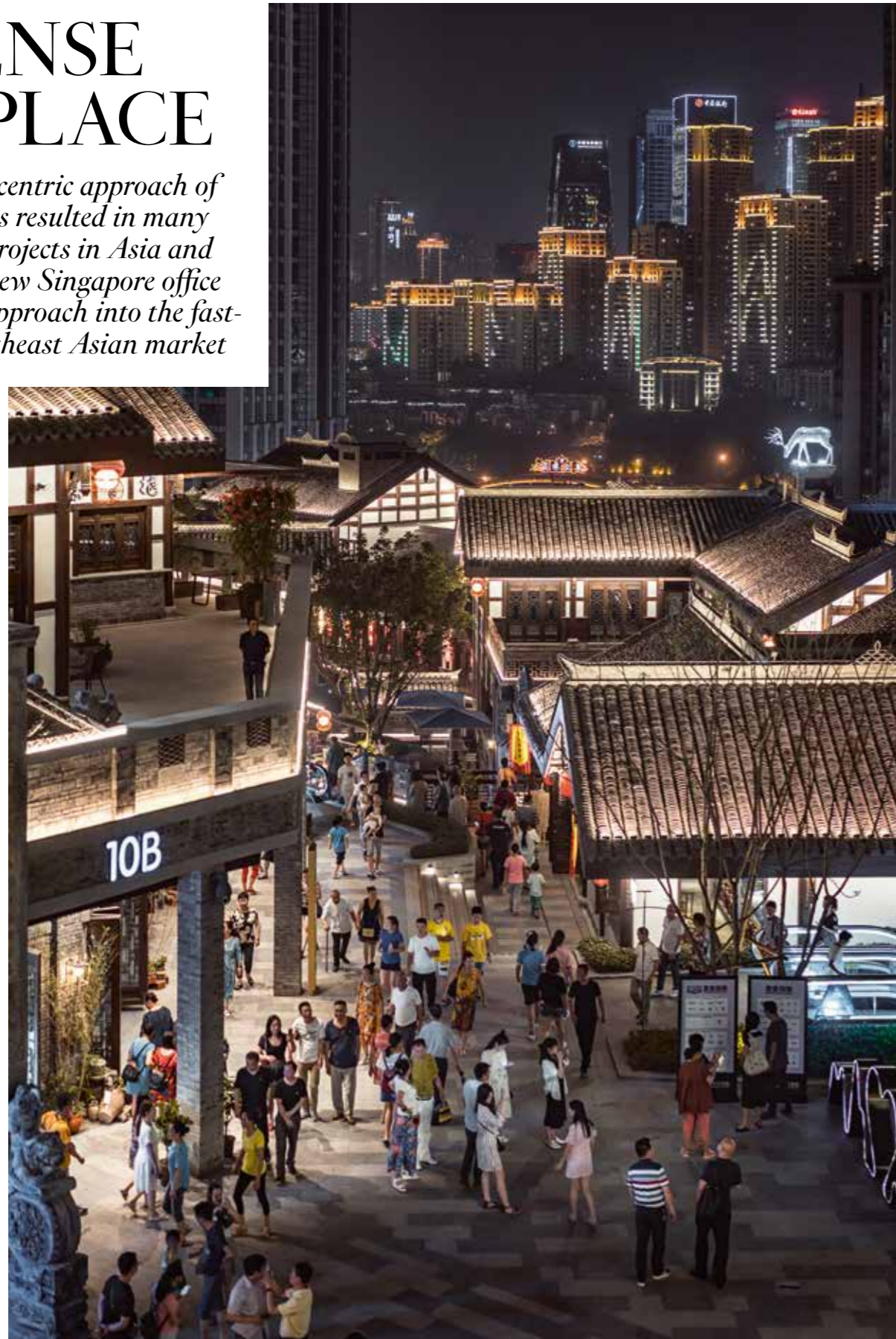
BY LUO JINGMEI

The human-centric approach of LWK+P has resulted in many illustrious projects in Asia and beyond. Its new Singapore office expands this approach into the fast-growing Southeast Asian market