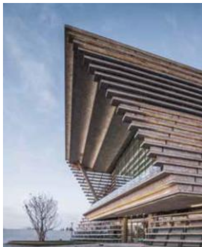
青岛铂悦 · 灵犀湾展亭