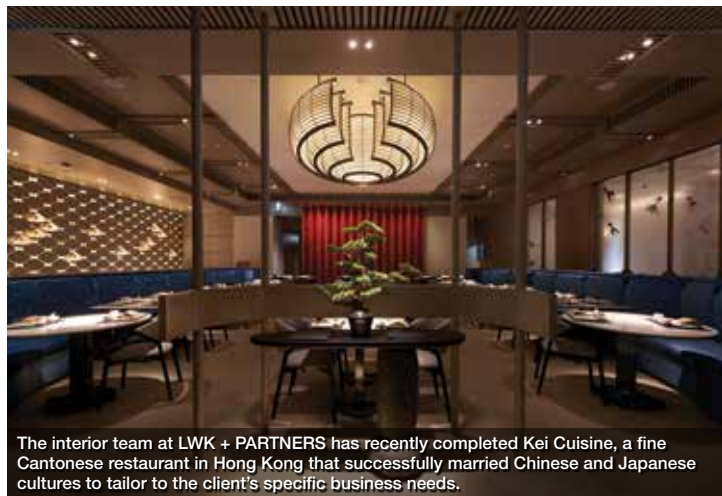
The interior team at LWK + PARTNERS has recently completed Kei Cuisine, a fine Cantonese restaurant in Hong Kong that successfully married Chinese and Japanese cultures to tailor to the client's specific business needs.