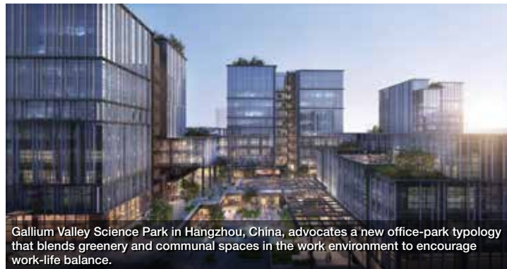
Gallium Valley Science Park in Hangzhou, China, advocates a new office-park typology that blends greenery and communal spaces in the work environment to encourage work-life balance.

The firm is also well-known for its early adoption of the Building Information Modelling (BIM) technology, a vital capability that expedites the design process from conception and master plans to execution with minimal data loss. With its strengthened technological and data processing capabilities, as well as exposure