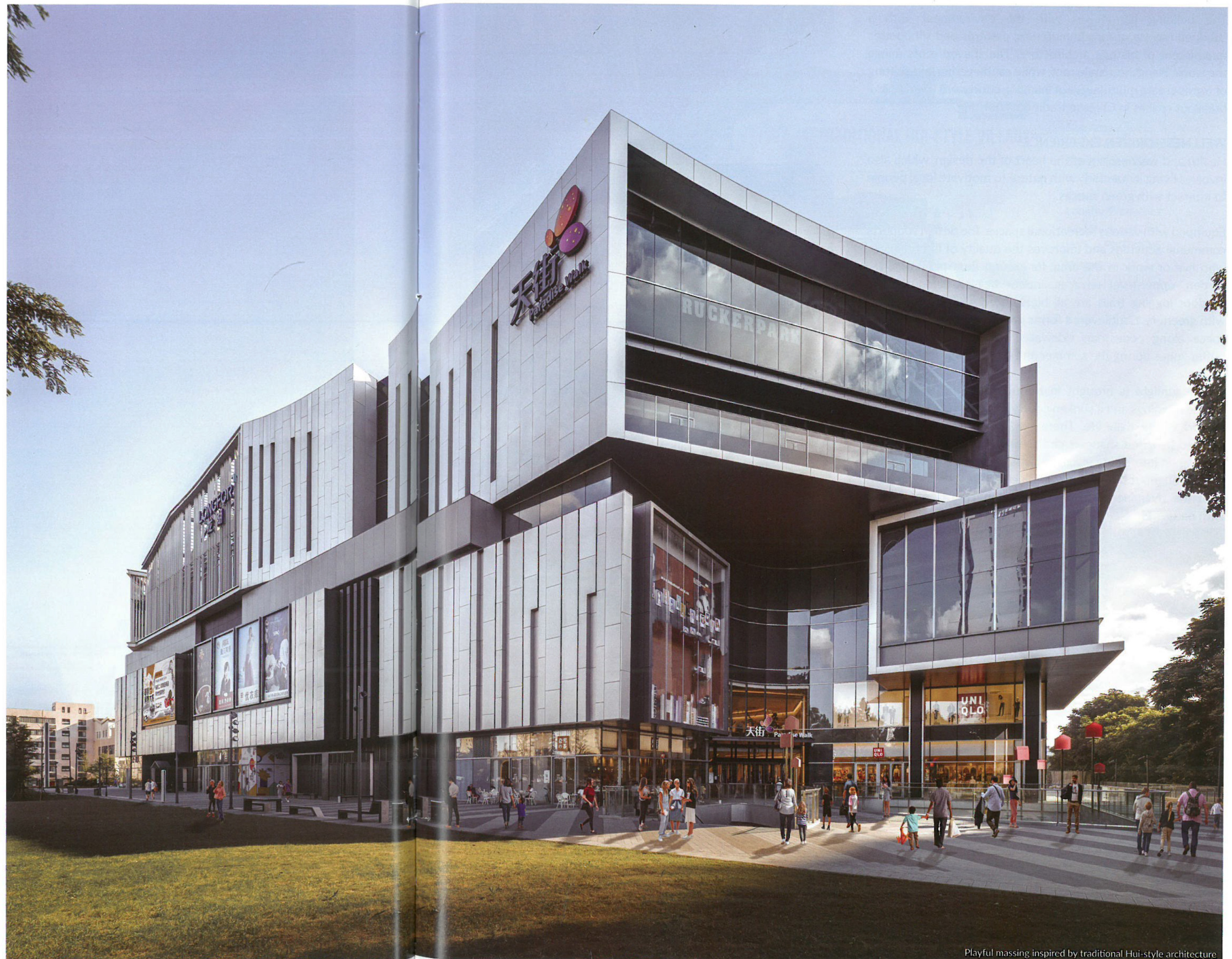
Playful massing inspired by traditional Hui-style architecture

The overall design of the retail mall captures the elegance and conciseness of traditional Hui-style architecture with playful modern design language. Hui-style architecture is known for its stark white walls, which are given a fresh remake at the project through silvery facades. Extra-thin aluminium panels are primarily used in the facades, creating staggered patterns with a natural unevenness resembling ancient brickworks.