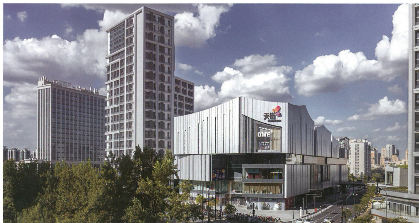
Facade material is dominated with extra-thin aluminium panels