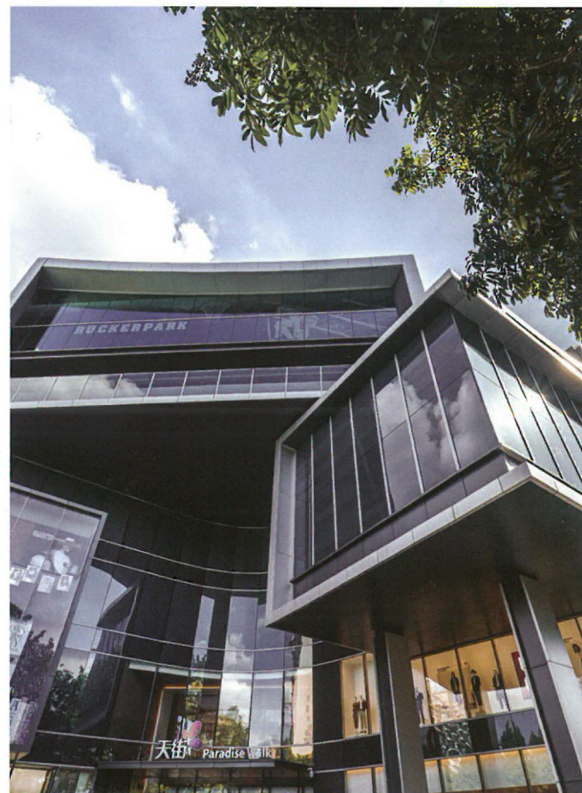
Multi layers of 'hanging courtyards' from the cantilevering masses