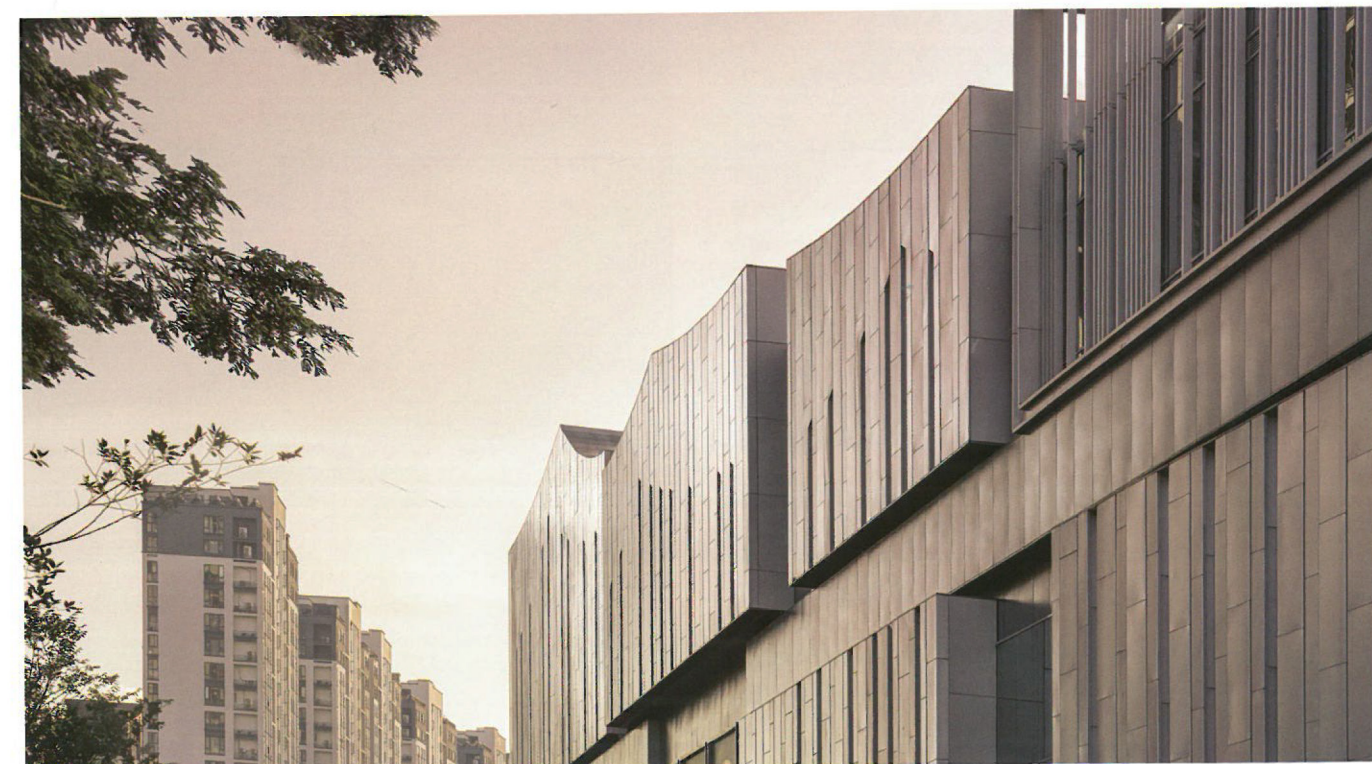
The iconic Hangzhou-style-inspired silvery shaved roof