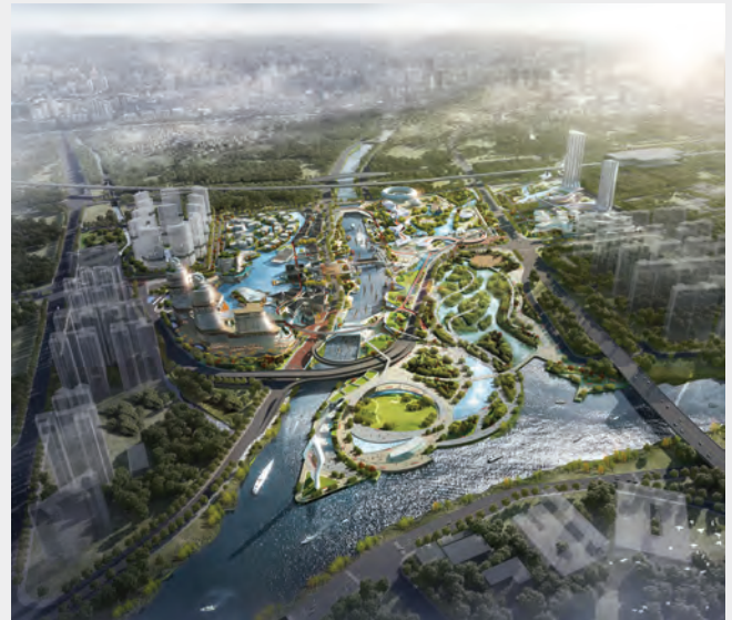
Rendering: © LWK + PARTNERS

Zhongshan OCT Harbour will have a theme park, retail areas, residences, hotel accommodation, entertainment facilities and offices across both sides of the river, creating a diversified commercial, recreational and living experience on a rich, eco-friendly landscape. As the project develops, a respect for nature, local culture and Lingnan aesthetics gradually unfolds.